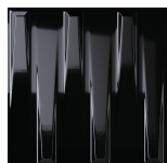
DUTTON BLACK GLOSS WB253DE