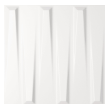
DUTTON NEVE SATIN WB253DLB