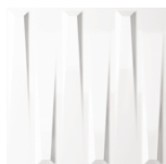
DUTTON WHITE GLOSS WB253DLB