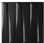
DUTTON BLACK SATIN WB253DRB