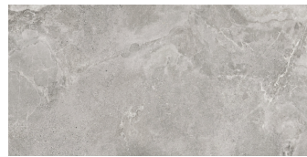
DOME ASH P8016L