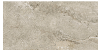
DOME NUT P8016L