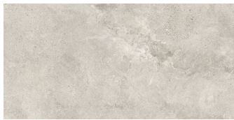
DOME BONE P8016L