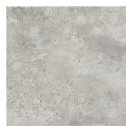
CAPITAL PERLA PR8080L