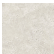
CAPITAL BLANCO PR8080L