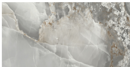
AGATE GREY PULIDO BT6012GRP