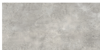
CAPITAL PERLA P8016L