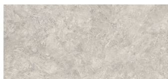
CANYON GREY BP2612RB