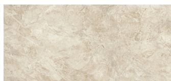
CANYON BEIGE BP2612RB