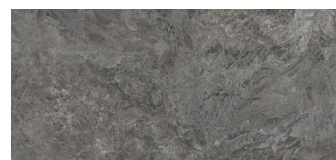
CANYON BLACK BP2612RE